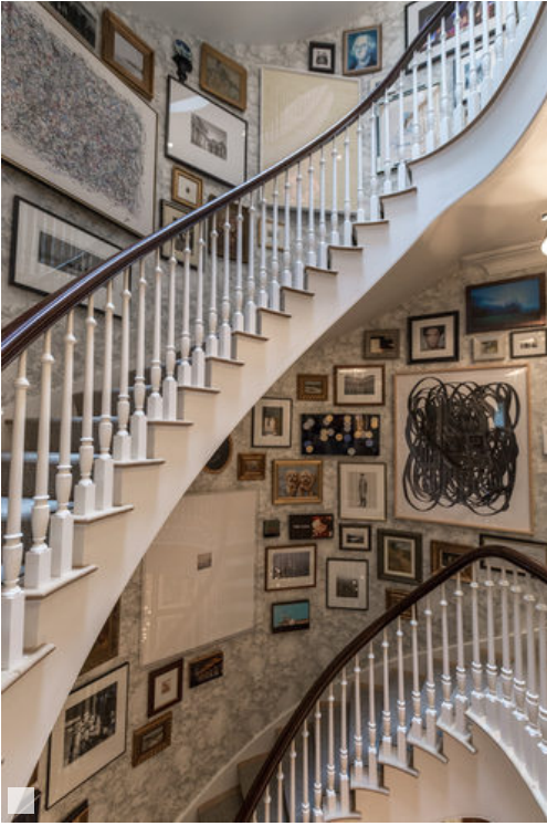
Another view of Mitchell's winding stair gallery.