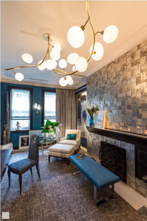
† Pavarini Design created a sultry lounge space fittingly called "Midnight Manhattan." The room, adjacent to the master bedroom, is invoked as an evening lounge and workspace for the home's owners. One stunning detail is its $100,000-plus Jeff Zimmerman vine chandelier with iridescent glass globes.