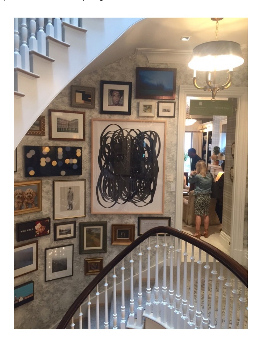
This was a HUGE job as this staircase was insane.