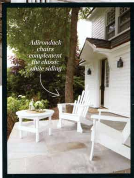
Adirondack chairs complement the classic white siding

Despite being a new-build, the coach house was designed to look old. Philip went for divided windows, an Enviroshake roof that looks like authentic cedar and trim details true to the period of the main cottage, which was built in 1795. Pretty hydrangea bushes keep the coach house totally private.