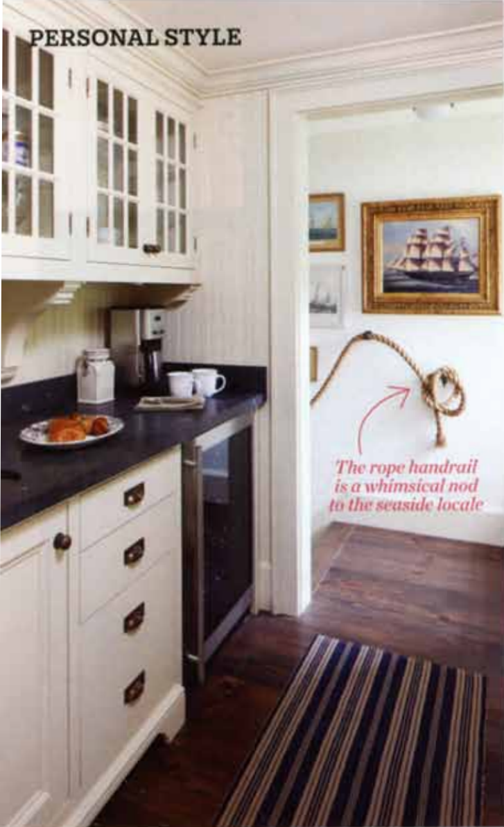
The rope handrail is a whimsical nod to the seaside locale

< PRIORITIZE PRACTICALITY Because the guest suite is small, Philip had to maximize space with clever storage solutions. Along one wall of this narrow hallway, he put in a bar with fully stocked cabinets, a mini fridge and sink. Directly opposite, built-in drawers and shelving function as clothing storage (not shown). Cabinets , Bellini Custom Cabinetry; hardware , The Door Store; countertop, backsplash , Ast Stone.