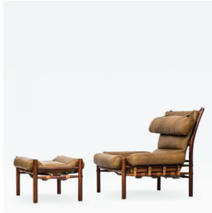
ARNE NORELL – NORELL MÖBEL AB Arne Norell Easy Chair Model Inca by Norell Möbel AB in Sweden