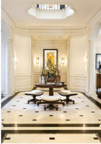
Left: A view through a column-bracketed archway to a luminous living room appointed with a mix of traditional and neoclassical style tables, a deco-inspired daybed, and artwork celebrating the theme of classical architecture. Right: The elegant entry hall is replete with classical motifs. A pedestal-base center table encircled by three stools of Philip's design is positioned beneath the shaft of natural light coming from the ceiling's oculus opening.