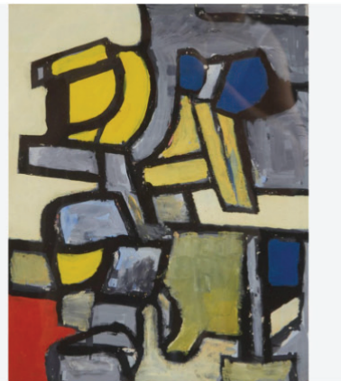
NELL BLAIR WALDEN BLAINE "Abstraction CH Collection #H," 1940s Lost City Arts