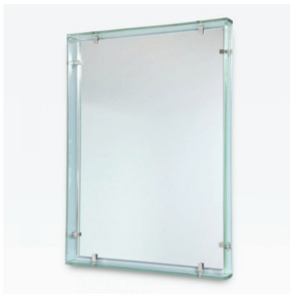
FONTANA ARTE Rare Rectangular Mirror by Fontana Arte Donzella

Name an architect, artist or designer, living or dead, you'd love to collaborate with and why?