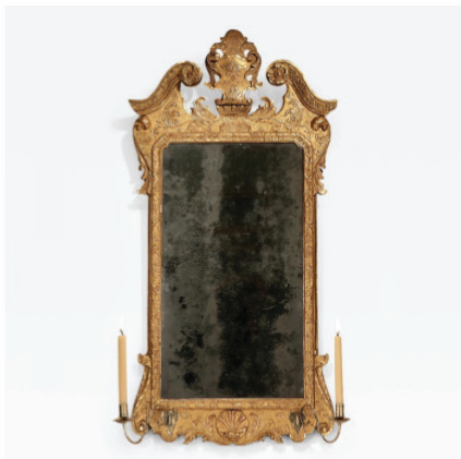
M. FORD CREECH ANTIQUES George III Gesso & Giltwood Mirror, England, c1730 Antiques & Fine Art Magazine