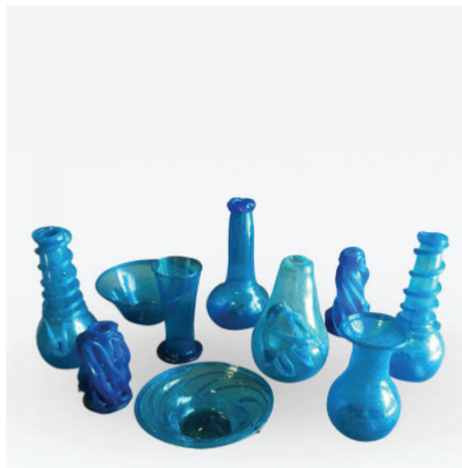
Collection of Blue Blown Glass from Afghanistan Bermingham & Co.