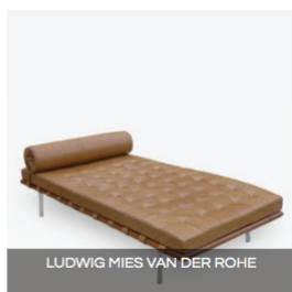
LUDWIG MIES VAN DER ROHE