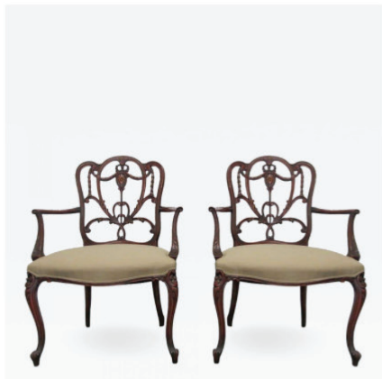
Pair Hepplewhite Style Armchairs Flavor