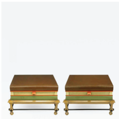
JOHN DICKINSON Pair of Rare Stacked Books End Tables Assemblage Ltd