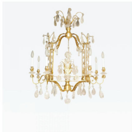
A Gold Leaf Rock Crystal Draped Chandelier David Duncan Ltd