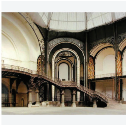
ROBERT BOURDEAU Color Print, Edition 1 of 15 Jamie Pryde