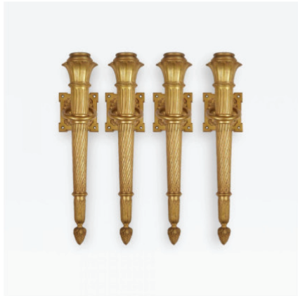
A Set of Four Neoclassical Style Gilt-Bronze Torch Form Wall Lights David Duncan Ltd