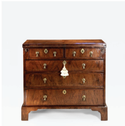
M. FORD CREECH ANTIQUES George I Walnut & Walnut Veneered Bachelor's Chest England, c1715-20 Antiques & Fine Art Magazine