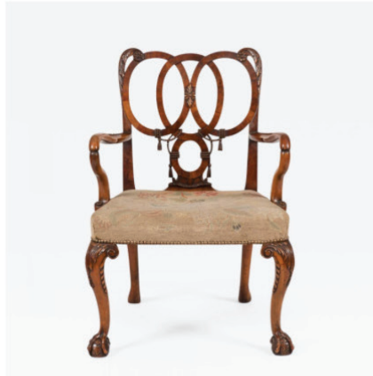
English Carved Walnut Armchair in the George II Style Butchoff Antiques