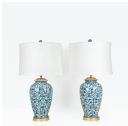
Pair of Porcelain with Wooden Base Gold-Plated Task Table Lamps La Maison Supreme