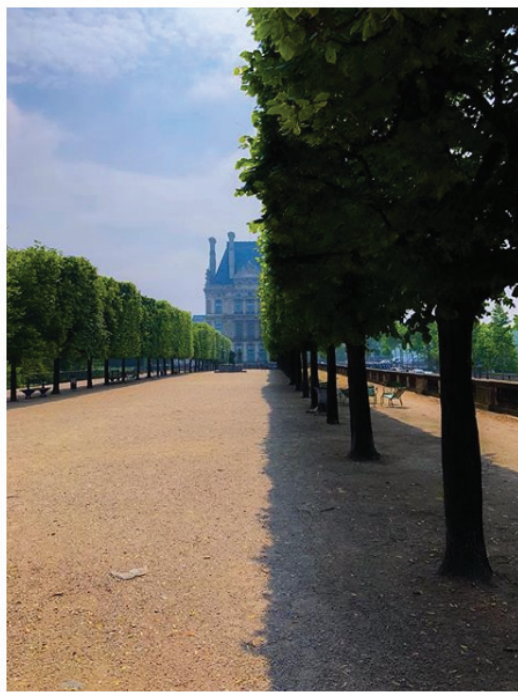
{A Moment Captured in Paris on a Recent Visit}