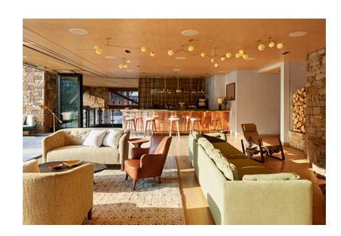
Caldera House, Jackson Hole