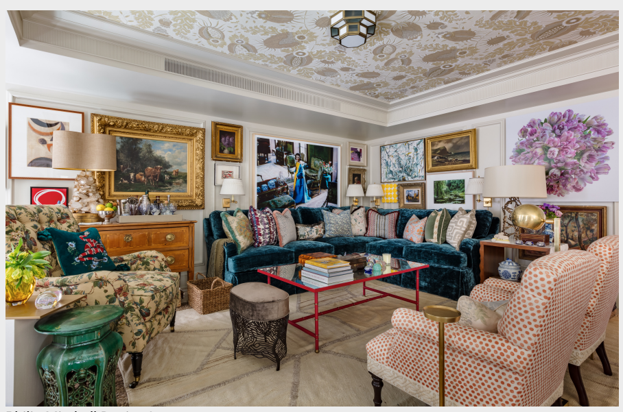
Philip Mitchell Design Inc.