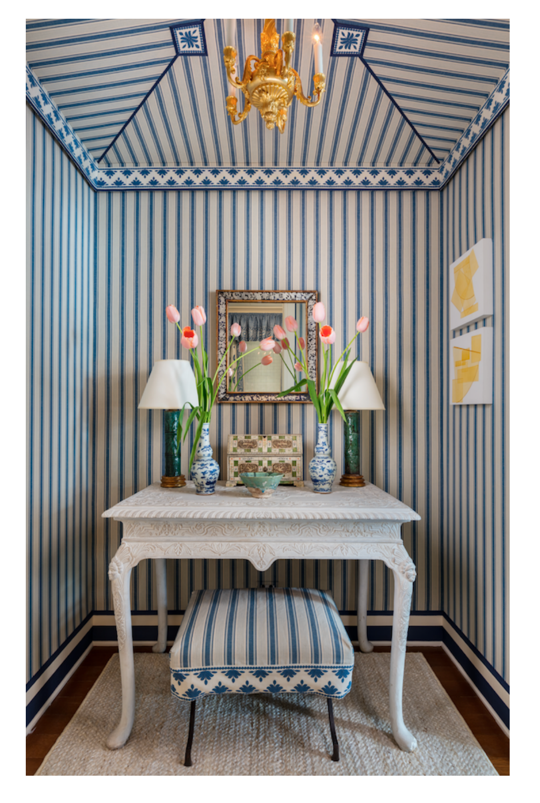
Mark D. Sikes "Sleeping Beauty" Bedroom