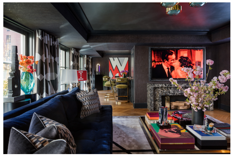
B.A.Torrey "After Party" Lounge