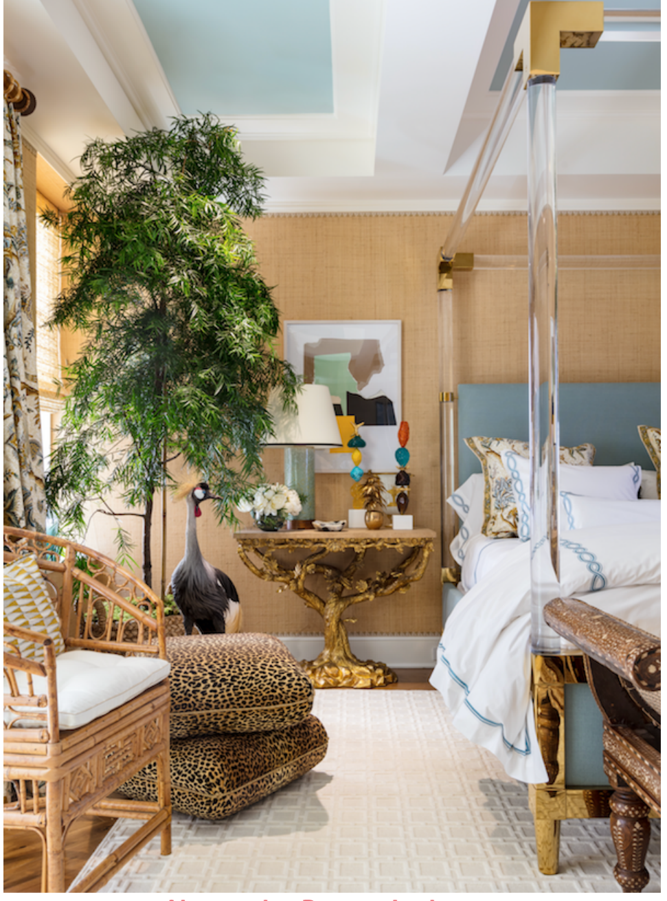
Alessandra Branca bedroom

Kips Bay Decorator Show House 110 East 76th Street New York, NY 10021