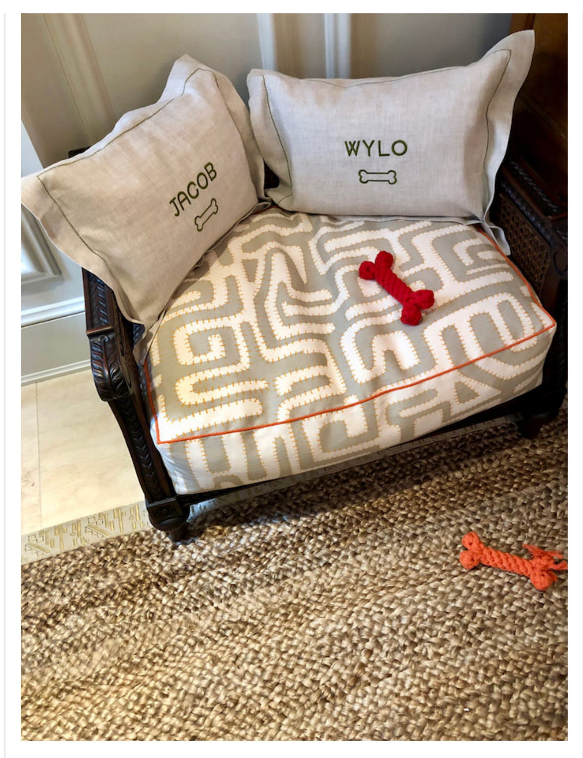
and a book chronicling their journey at the show house, which will available to purchase benefitting the Kips Bay Boys & Girls Club.