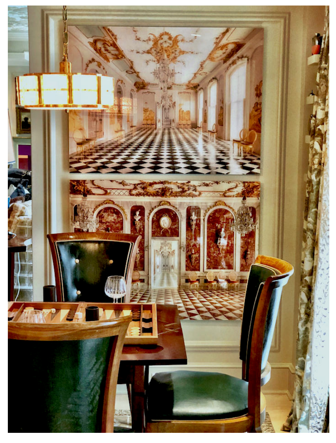
and who had bought the über chic Gucci pillow yet also loved their chintz arm chair that had perhaps survived other homes or generations.