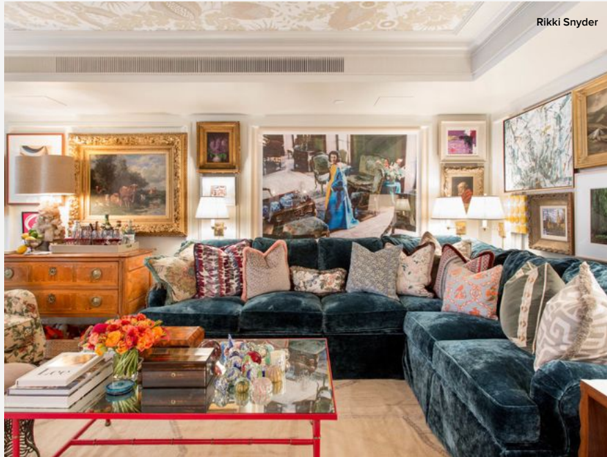
Drawing Room (this photo and next two)