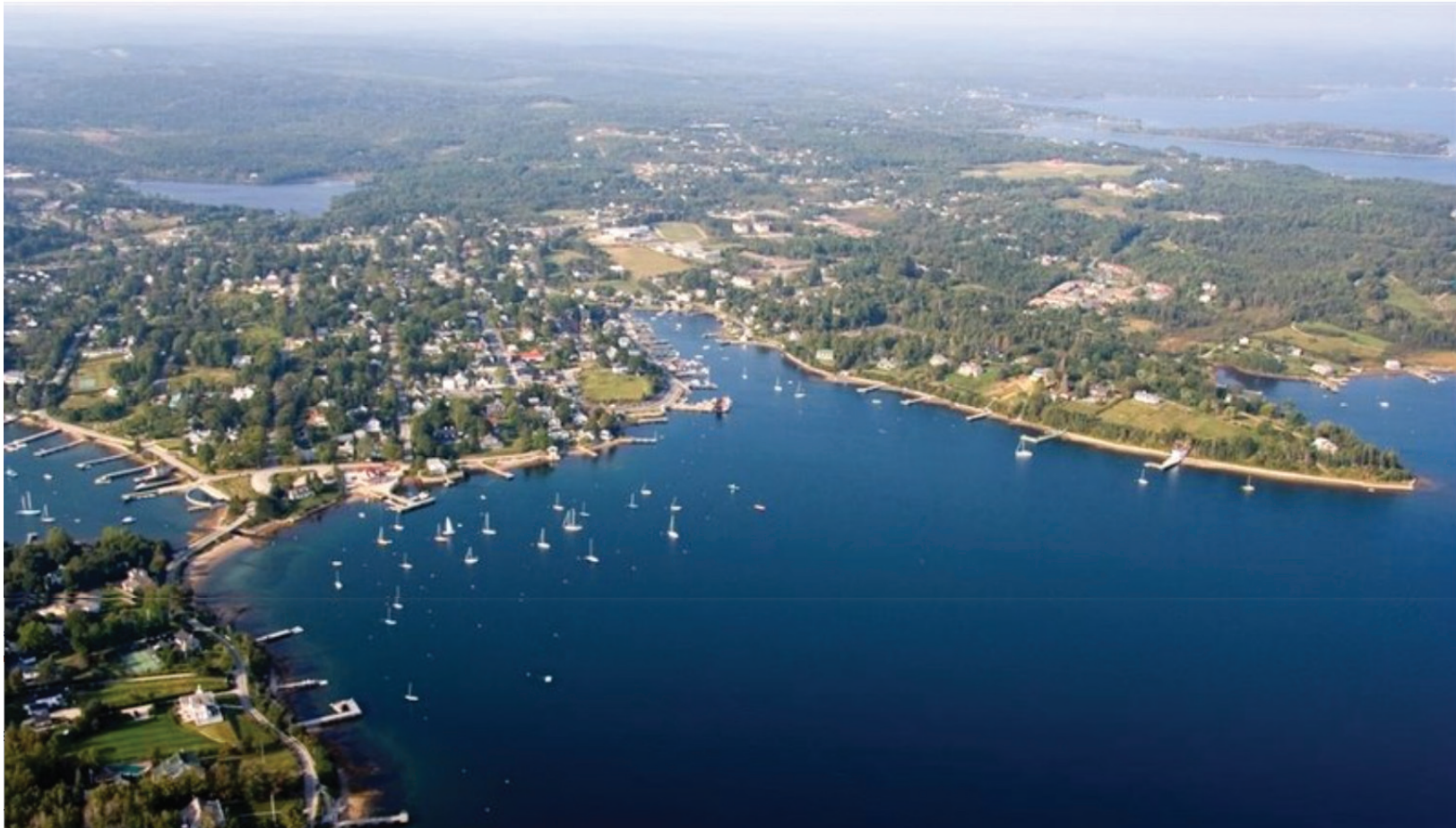
Chester, Nova Scotia.

I quickly shower, dress, and enjoy a second espresso before heading to the airport. Check emails and Instagram from the car en route to the airport. Destination: New York, to source for my 2018 Kips Bay Show House room.