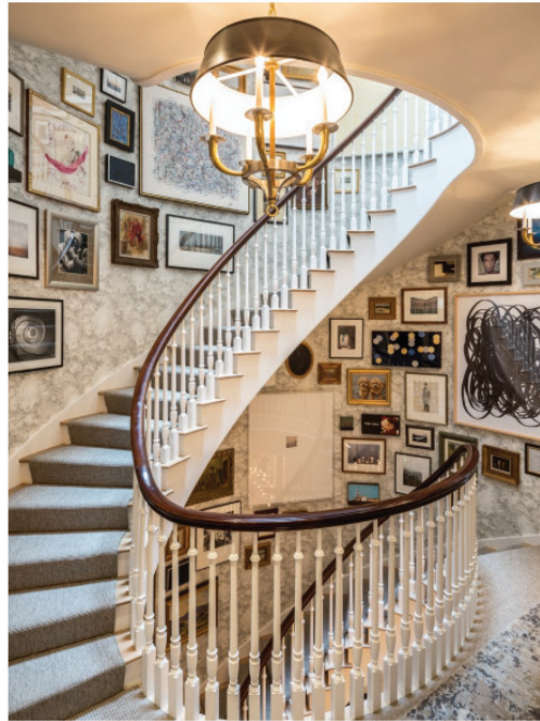
Mitchell's staircase for the 2016 show house was a hit with its patterned wallpaper and tons of art.