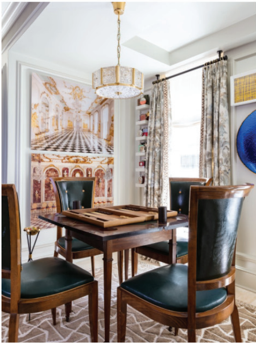
A corner table is set as though a game is in progress.