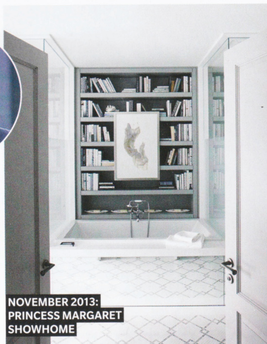
NOVEMBER 2013: PRINCESS MARGARET SHOWHOME