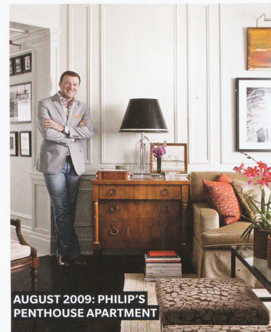
AUGUST 2009: PHILIP'S PENTHOUSE APARTMENT