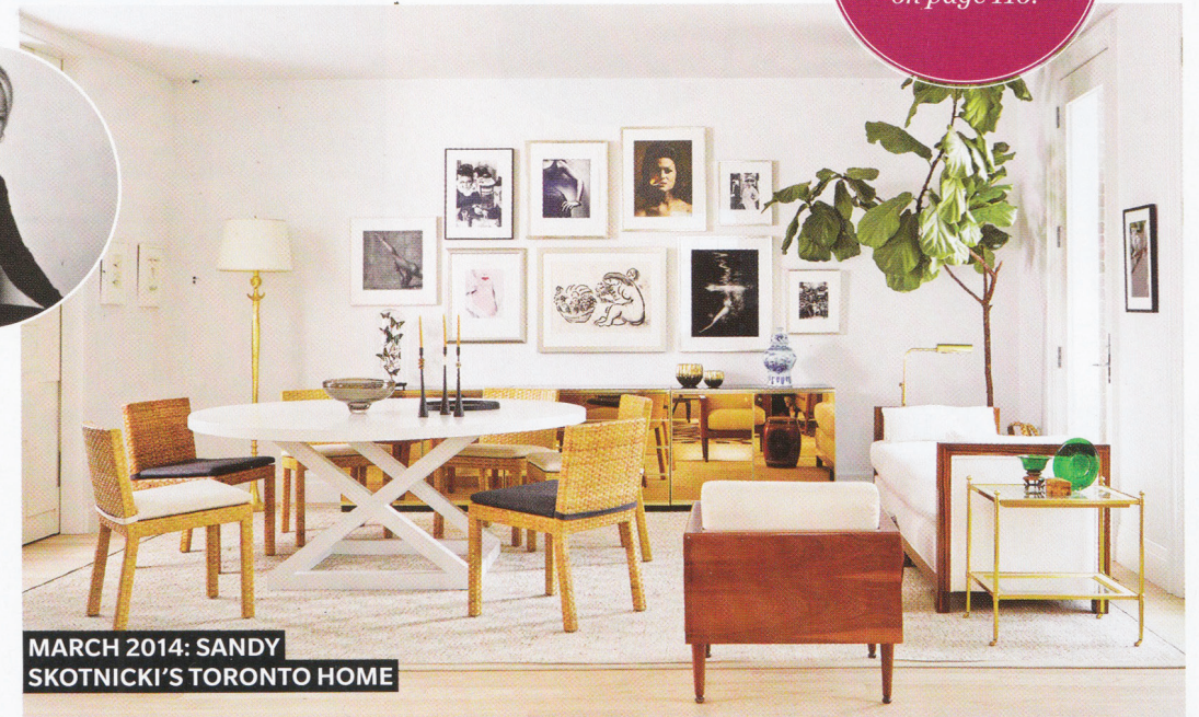
MARCH 2014: SANDY SKOTNICKI'S TORONTO HOME