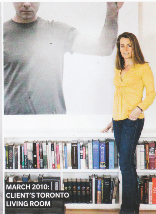
MARCH 2010: CLIENT'S TORONTO LIVING ROOM