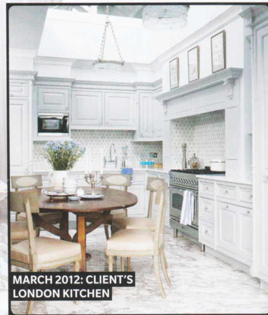
MARCH 2012: CLIENT'S LONDON KITCHEN